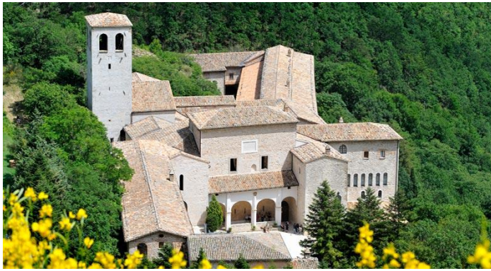
Monastery of the Holy Cross of Fonte Avellana

On this first full day of our trip, we travel into the Apennines to Fonte Avellana . Situated below Mount Catria at 1700 m, this 10 th century monastery retains its original beauty through the simplicity of its architecture and its harmony with the surrounding nature. We will have a tour of the monastery and its ancient scriptorium. After we enjoy a picnic lunch, you will have time to quietly explore the grounds, bookshop, and hiking paths for yourself.