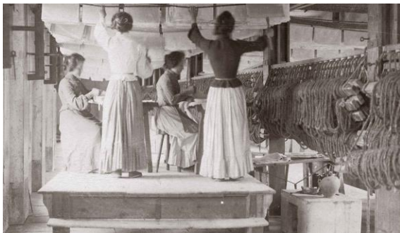
Women hanging newly made paper to dry (Fabriano)

We spend the entire day getting to know Fabriano with something for everyone. Shoppers can wander past the many stalls at the Wednesday market, art lovers can enjoy the Pinacoteca gallery, and those interested in history of craft can visit the city's Paper Museum. Since the 1200s, Fabriano has been famous for its paper making, and inside the museum you can see a demonstration of how paper has been made through the centuries.